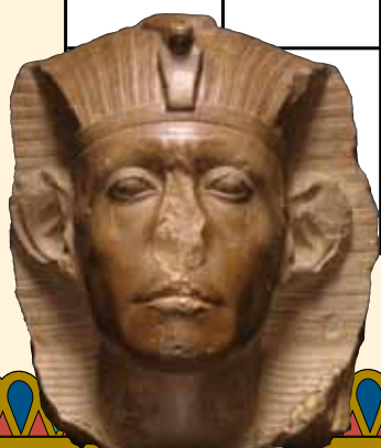
Head of Sesostris III